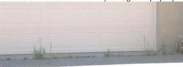
Don't let weeds occupy driveway cracks, giving your home an abandoned appearance and perhaps inviting suspicious activity.