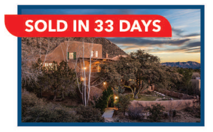
301 Spring Creek Place NE 3882 SQ FT 3BR 3BA 1 Acre