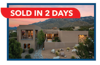
370 Big Horn Ridge Drive NE 3824 SQ FT 3BR 3BA .57 Acres