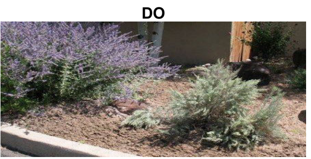
Keep soil and gravel raked and inhospitable to weeds

The Covenant Support Committee (CSC) receives scores of complaints about landscaping and yard maintenance, particularly in units comprised of patio homes. If you own a property with zero lot lines, think about the obvious importance of curb appeal and the need for attractive frontage so close to the street and so visible among clustered homes. Residents in the zero-lot-line units should be mindful that the appearance of their yards has a greater impact on the surrounding neighbors than is the case with larger lots.