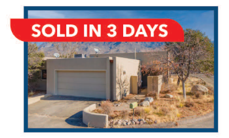
1812 Tramway Terrace Loop NE 1288 SQ FT 2BR 2BA .06 Acres