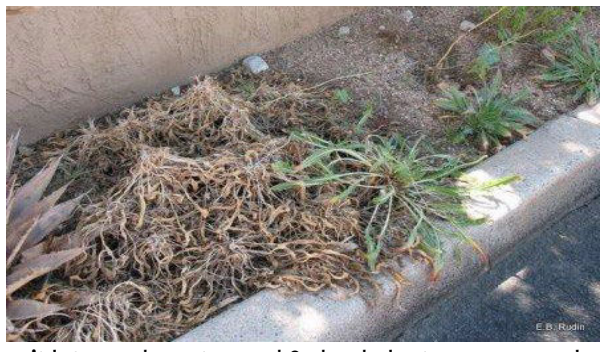
Don't let weeds go to seed & dead plants convey neglect.