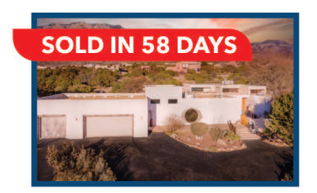
1038 Tramway Lane NE 4000 SQ FT 4BR 4BA 1.01 Acres