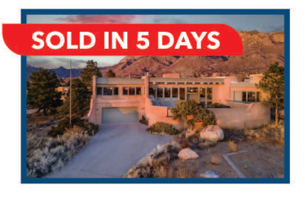
808 Tramway Lane NE 2557 SQ FT 32BR 2BA .061 Acres