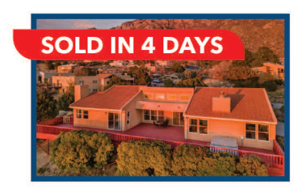
73 Pinon Hill Place NE 3266 SQ FT 3BR 3BA .55 Acres