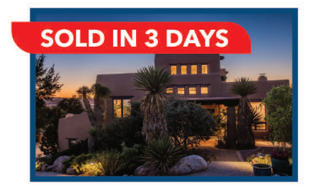
349 Paintbrush Drive NE 4143 SQ FT 4BR 4BA .81 Acres