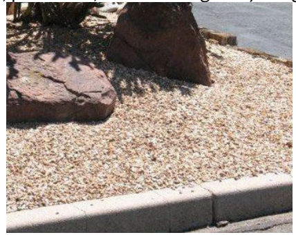
Keep curbs tidy and corners cleared and visible.

Please help your neighborhood, yourselves, and the CSC by controlling your landscape and weeds throughout the growing season. Don't wait until plants are unwieldy, become woody, or constitute fire and/or safety hazards. Just as we schedule haircuts every so often, let's keep our properties looking cared for and attractive. In fact, while we're at it, let's remove our dead vegetation too: this is one covenant that applies to all property-owners. Good landscape maintenance will help keep our home values strong, our streets safer due to fire prevention and clear sightlines for vehicles, bicycles, and pedestrians, and Sandia Heights as beautiful as it can be.