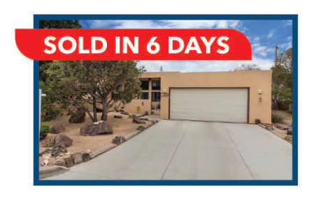
2039 Quail Run Drive NE 2160 SQ FT 3BR 2BA 0.2 Acres