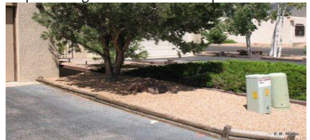
Prune trees, pull weeds, and trim hedges adjoining other lots.