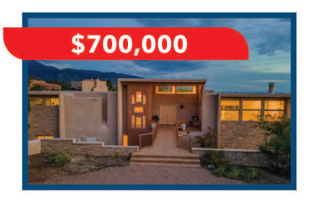
88 Juniper Hill Place NE 2876 SQ FT 4BR 2.5BA 1 Acre