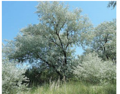
Russian olive. It's not Russian, and no olives

Trees: It's best to catch troublesome species early