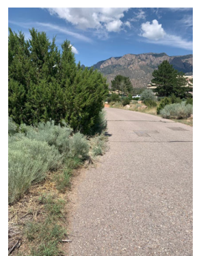
Needs a trim. Can you see the UPS truck? Or vice versa?

Another place we don't want plants "invading" is overhanging and obstructing the streets and walking space. It is the homeowner's responsibility to maintain their yard, even in the setback up to the street edge. County regulations can result in fines in some cases, perhaps even liability according to some. You may not mind a specific plant but your neighbors and folks walking by