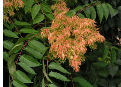
Tree of Heaven

before they become large. Russian olive, salt cedar/tamarisk, Siberian/Chinese elms, Tree of Heaven, and even Ponderosa pines and cottonwoods are all considered problem trees by some lists, as they grow and spread quickly. On the positive side, in the right spot and well managed they provide great can shade—like the cottonwoods in Silver Cloud Park. Out of control, you get root problems or tree thickets you can't even walk through. See: smithsonianmag.com/ science-nature/how-wecreated-monster-american-southwest-180956878