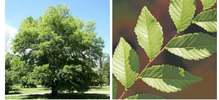
Siberian elm and a close-up of its leaves

before they become large. Russian olive, salt cedar/tamarisk, Siberian/Chinese elms, Tree of Heaven, and even Ponderosa pines and cottonwoods are all considered problem trees by some lists, as they grow and spread quickly. On the positive side, in the right spot and well managed they provide great can shade—like the cottonwoods in Silver Cloud Park. Out of control, you get root problems or tree thickets you can't even walk through. See: smithsonianmag.com/ science-nature/how-wecreated-monster-american-southwest-180956878