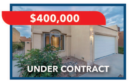
2125 Globe Willow Avenue NE 1610 SQ FT 3BR 2BA 0.1 Acres