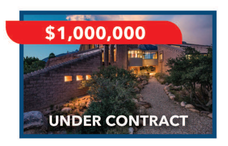
1010 Tramway Lane NE 3108 SQ FT 2BR 3BA 1.16 Acres