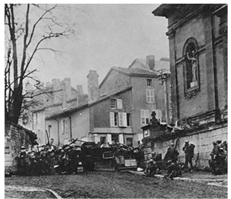
Soldiers of the 353rd Infantry near a church at Stenay, Meuse in France, wait for the end of hostilities. This photo was taken at 10:58 a.m., on November 11, 1918, two minutes before the armistice ending World War I went into effect

World War I—known at the time as "The Great War" officially ended when the Treaty of Versailles was signed on June 28, 1919, in the Palace of Versailles outside the town of Versailles, France. However, fighting ceased seven months earlier when an armistice, or temporary cessation of hostilities, between the Allied nations and Germany went into effect on the eleventh hour of the eleventh day of the eleventh month. For that reason, November 11, 1918, is generally regarded as the end of "the war to end all wars."