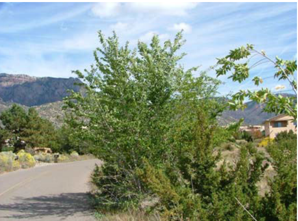
Siberian Elm 2-3 years old