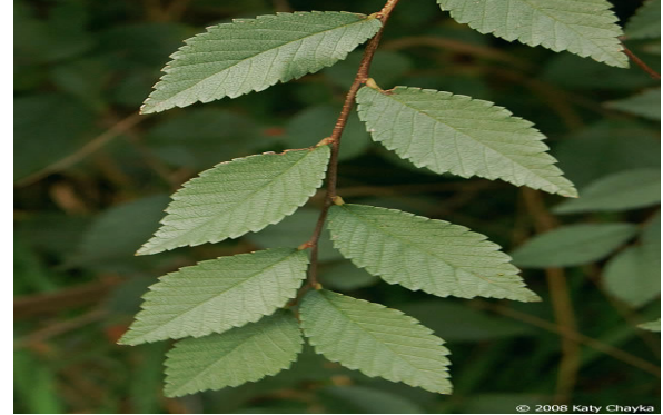
Siberian Elm leaf

The Siberian Elm invasion in Sandia Heights in many ways is comparable with the Salt Cedar invasion of the Rio Grande Bosque, which was allowed to continue far too long. It is now costing enormous amounts of money and effort to rid the Bosque of this weed. If you have Siberian Elm seedlings on your property it would be a lot easier to remove them now rather than deal with them later after they have become very large trees.