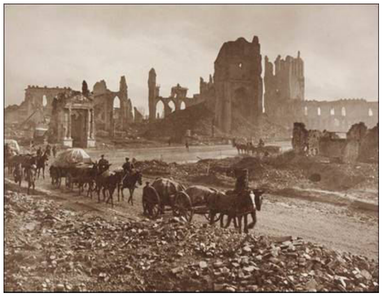
The ruins of the Cloth Hall, the Cathedral, and Bishop's Palace, Ypres

dedicated to the cause of world peace and to be thereafter celebrated and known as "Armistice Day." Armistice Day was primarily a day set aside to honor veterans of World War I, but in 1954, after World War II had required the greatest mobilization of soldiers, sailors, Marines and airmen in the Nation's history and after American forces had fought aggression in Korea, the 83<sup>rd</sup> Congress, at the urging of the veterans' service organizations, amended the Act of 1938 by striking out the word "Armistice" and inserting in its place the word "Veterans." With the approval of this legislation (Public Law 380) on June 1, 1954, November 11<sup>th</sup> became a day to honor American veterans of all wars.