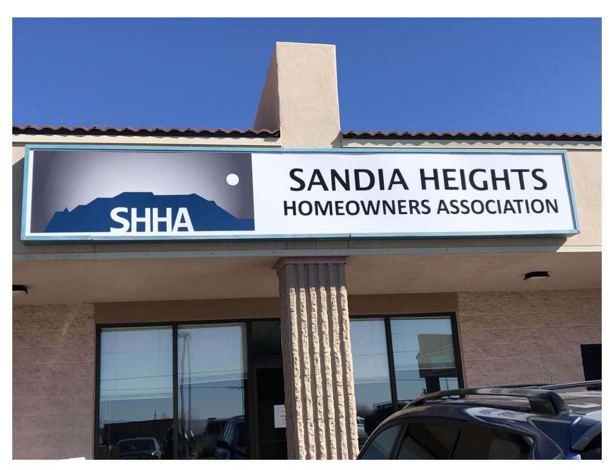
The new SHHA office sign is up.

Notice: Any corrections to the printed version of the GRIT can be found on the website: www.sandiahomeowners.org