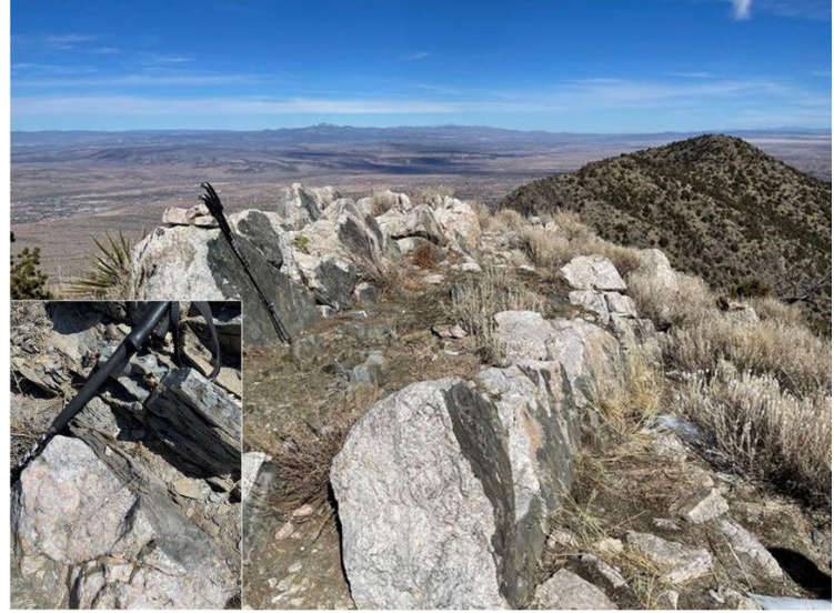
The metamorphic rocks at the top of Juan Tabo Peak are intruded by a "swarm" of stunning pegmatite dikes (The Jemez is in the background). Some of these "white" dikes can be seen from Sandia Heights. The inset shows a close-up of the coarse-grained fabric of these types of dikes, as well as a contact between the "white" dike and darker metamorphic rocks.