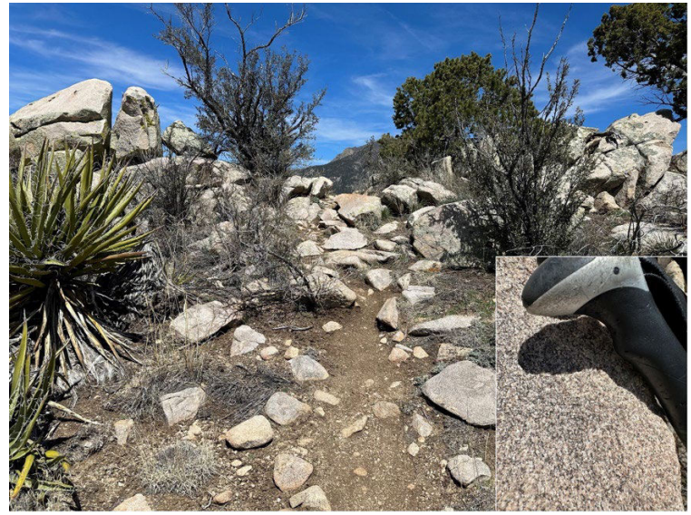
Here a trail in the Sandias goes up and over a large (and long) aplite dike "wall." The inset shows a close-up of the characteristic uniformly fine-grained "sugary" texture of these types of dikes.