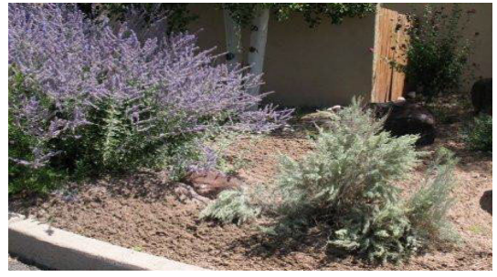
Keep soil and gravel raked and inhospitable to weeds.