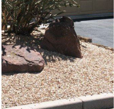
Keep curbs tidy and corners cleared and visible.