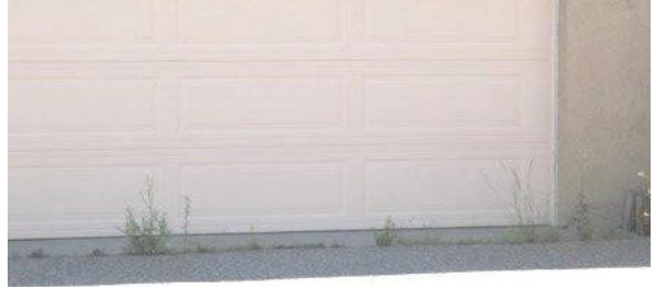
Don't let weeds occupy driveway cracks, giving your home an abandoned appearance and perhaps inviting suspicious activity.