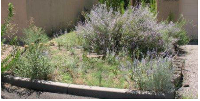
Don't allow weeds to encroach on your neighbor's property.