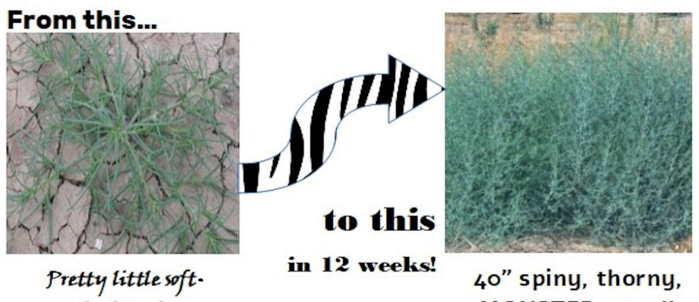
Pretty little soft-edged weed...

STEG began a second round of fundraising on the Go-FundMe platform on May 15. Please consider a donation that will support them in taking the case all the way to trial. STEG is a 501(c)(3)—donations are tax-deductible.