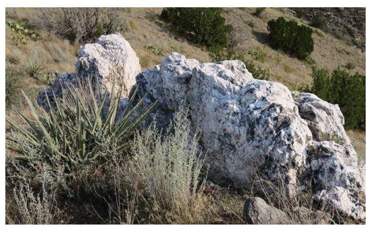
This picture shows an impressive chunk of a quartz dike sticking up out of the ground in the Rincon Hills, north of Sandia Heights, west of Forest Road 333.