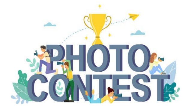
Photo contest. It's time to start thinking about submitting photos for the annual photo contest. The winning photo will be on the cover of the 2024 Sandia Heights Resident Guide and Directory and the photographer will be acknowledged. Subject matter should reflect something about living in Sandia Heights. To see some past submissions, please see previous 2023 editions of the GRIT . Submission deadline is November 4.

Notice: Any corrections to the printed version of the GRIT can be found on the website: <u>www.sandiahomeowners.org.</u> We always welcome Letters to the Editor and your response to articles in The GRIT. Email us at <u>thegritshha@gmail.com</u>.