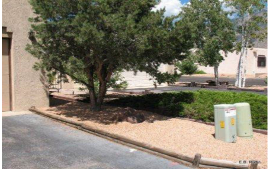
Prune trees, pull weeds, and trim hedges adjoining other lots.