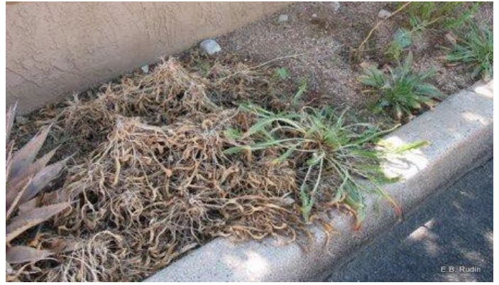
Don't let weeds go to seed & dead plants convey neglect.