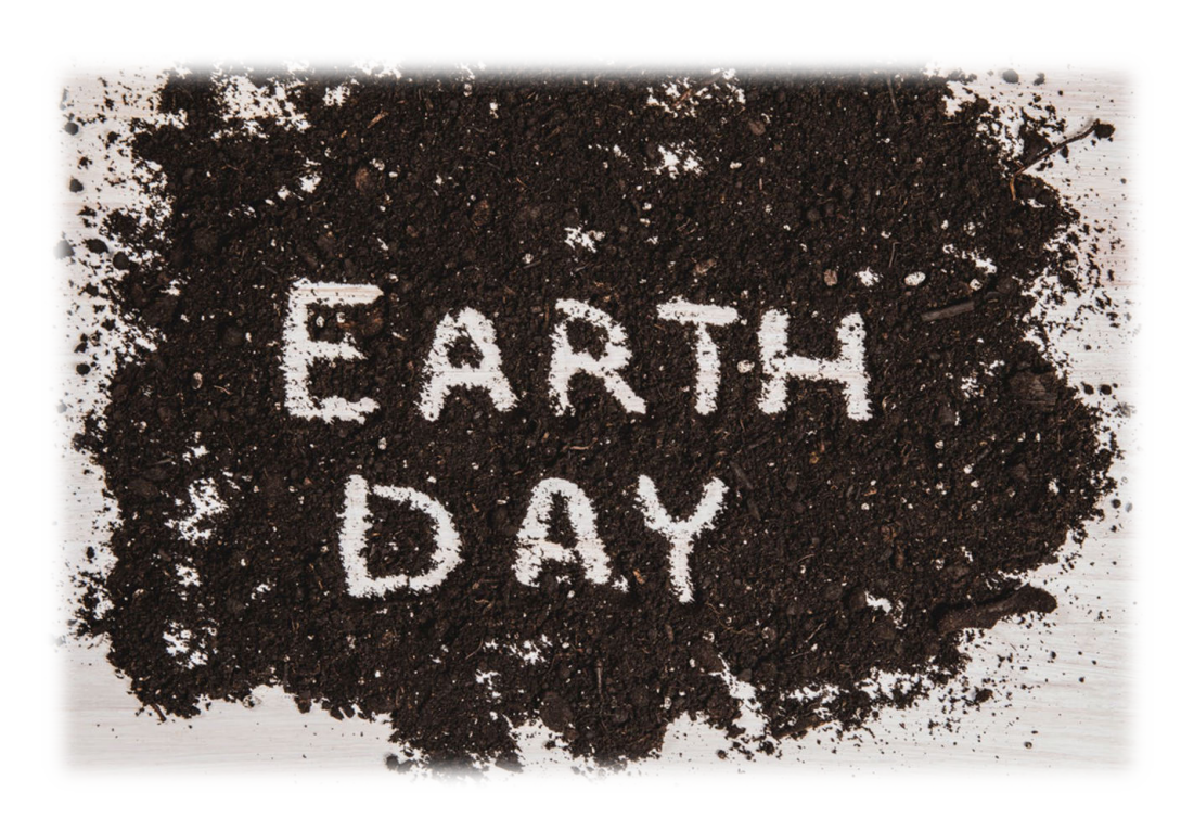
Happy Earth Day April 22

Sandia Heights Homeowners Association 12700 San Rafael Ave. NE Ste. 3 Albuquerque, NM 87122