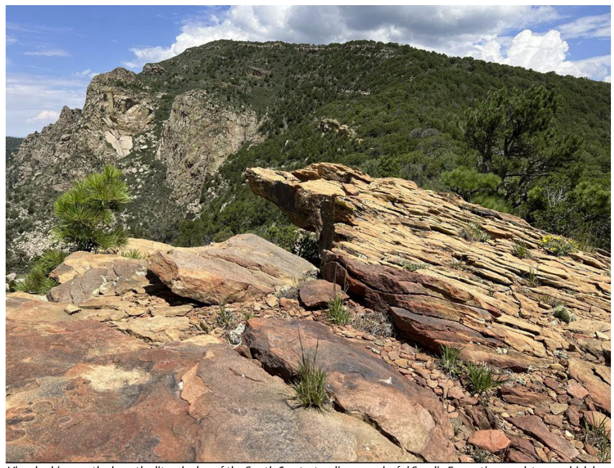
View looking north along the literal edge of the South Crest, standing on colorful Sandia Formation sandstone, which has been exposed in a wide swath due to the overlying Madera Limestone having been eroded away

There are places where a coincidence of gently tilting rock strata and gently inclining eroded ground surface has exposed the Sandia Formation along some portions of trails so you can hike right on top of it. Good examples are short stretches along the upper La Luz and South Peak trails. But the longest stretch of Sandia Formation in the mountains exists along a part of the South Crest Trail. This part of the Trail is the southernmost extent that is still located at relatively high elevation in a sparse Ponderosa zone. Here, long, gentle switchbacks will take you hiking across the Sandia Formation for an hour or so, depending on whether you are going uphill or down. A brief uphill departure from the trail above the junction with the Hawk Watch Trail will take you to a stunning setting not seen anywhere else along the edge of the Crest, where the colorful Sandia Formation forms the western facing edge of the Crest, as shown below.