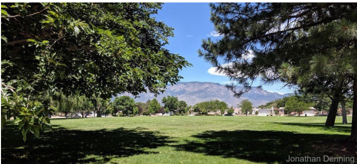
Loma Del Norte Park