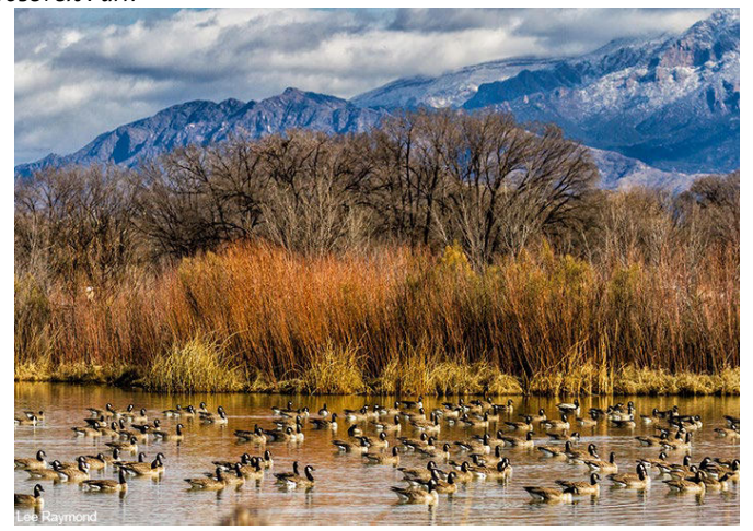
Rio Grande Nature Center State Park