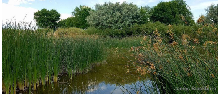
Mariposa Basin Park