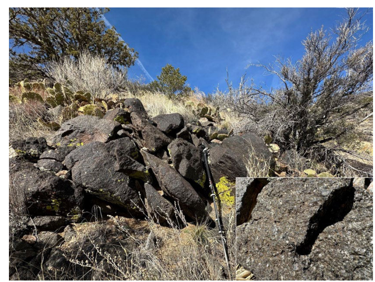
Portion of a large "black" dike near the junction of Old La Luz Trail and Tramway Trail (FR333 or Tram terminal parking). This dike is close to Sandia Heights; it requires a short off-trail hike to reach, but it can be seen from the trails without leaving them. The exposed portion of this dike has broken apart into large boulders. A patina of desert varnish (manganese oxide) appears to have made these rocks "extra" black. The inset shows a closeup of sparkly coarse-grained texture on a fresh face.

"black" mafic dikes are not as magnificent as, for example, the dikes at Ship Rock. However, because they are uncommon here, and mark the onset of a significant geologic event setting the stage for present-day physiography in Albuquerque, they are in their own way ... "mafic-nicent"!