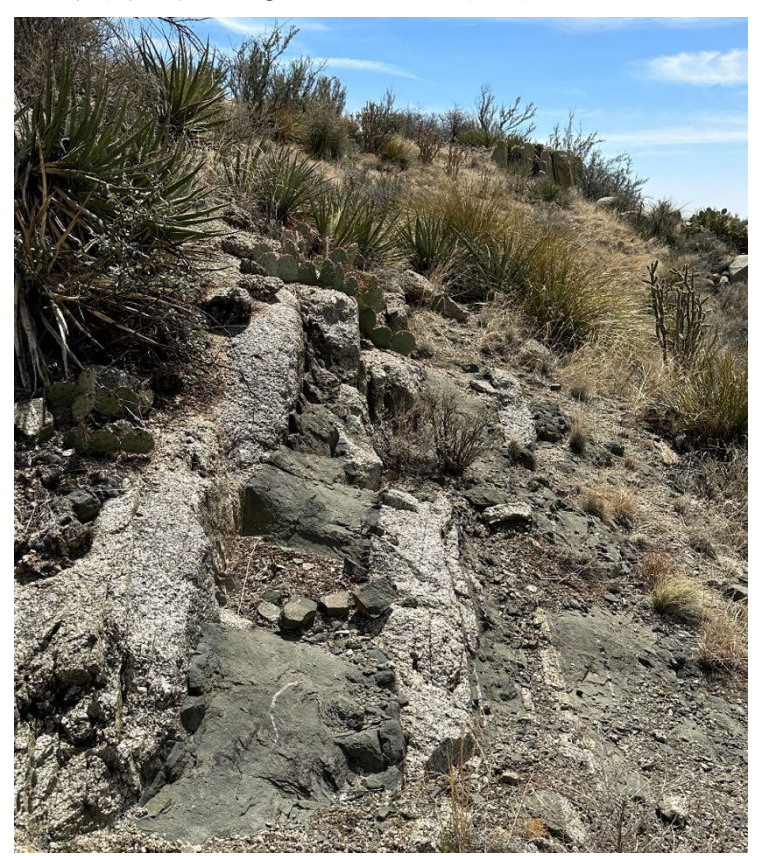
Striking example of dark-colored mafic dike interfingering with light-colored Sandia Granite, forming stripes on the ground. This location is close to a well-established, but "no-name," trail that heads north out of Embudo Arroyo (Indian School Road parking) up to Whitewash Trail and Ridge.