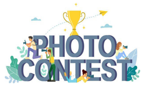
Photo contest. It's time to submit your photos for the annual photo contest. The winning photo will be on the cover of the 2024 Sandia Heights Resident Guide and Directory and the photographer will be acknowledged. Subject matter should reflect something about living in Sandia Heights. To see some past submissions, please see previous 2023 editions of the GRIT or check out the SHHA website. Submission deadline is November 4.

Notice: Any corrections to the printed version of the GRIT can be found on the website: <u>www.sandiahomeowners.org.</u> We always welcome Letters to the Editor and your response to articles in The GRIT. Email us at the gritshha@gmail.com.