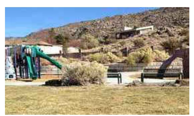
Linear Park Play Area

Parks--We have our own parks: W. L. Jackson Park at 8600 Tramway Blvd NE, and Little Cloud Park at 1850 San Bernardino Ave NE. For an unusual experience visit Casa Grande Linear Park, one tenth of a mile east of the intersection of Tramway and Comanche. The park goes a short distance north, or meanders further south to Piedra Lisa Park at Menaul, just .2 mile east of Tramway.